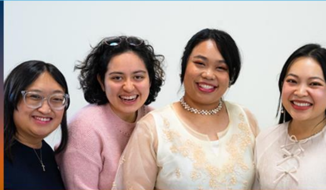
Asian Pasifika Desi American (APDA+) Student Summit & Scholar Recognition