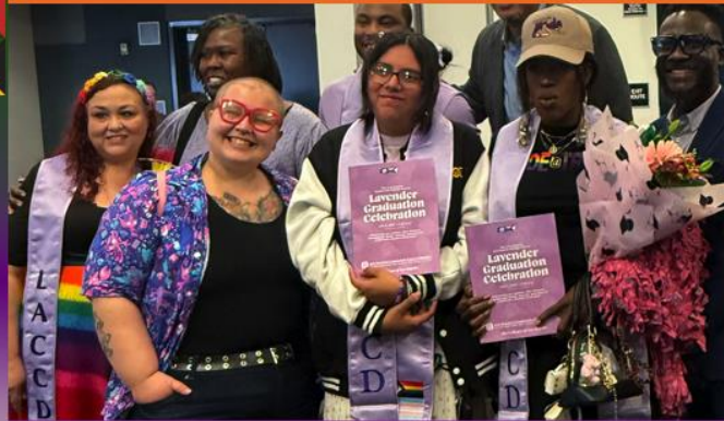
Lavender Graduate Celebration