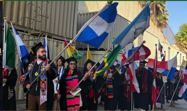
Mi Gente Graduate Celebration