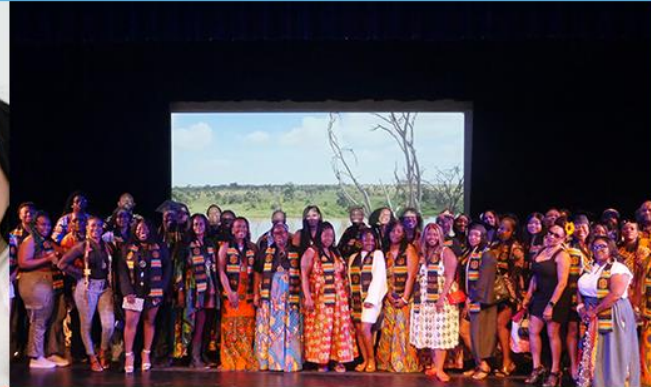
Black Graduate Celebration