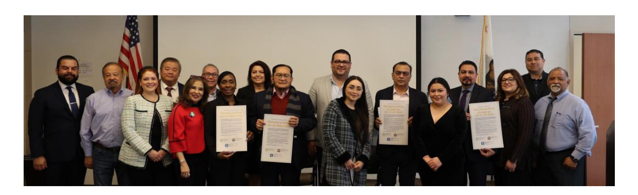
<u>East Los Angeles College (ELAC) and Universidad de Oriente UNIVO</u> <u>Forge Partnership to Empower Salvadoran Community through</u> Education