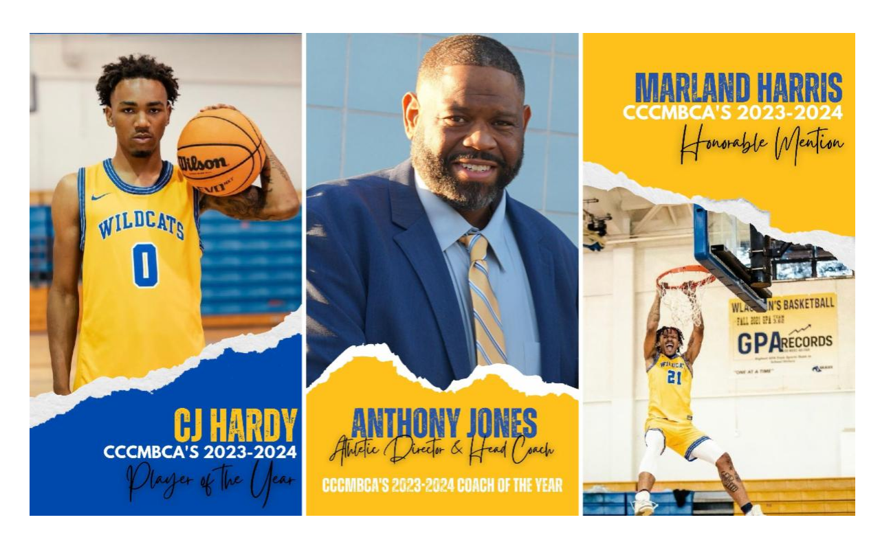
Men's Basketball Makes It To The "Elite 8" & Wins Awards