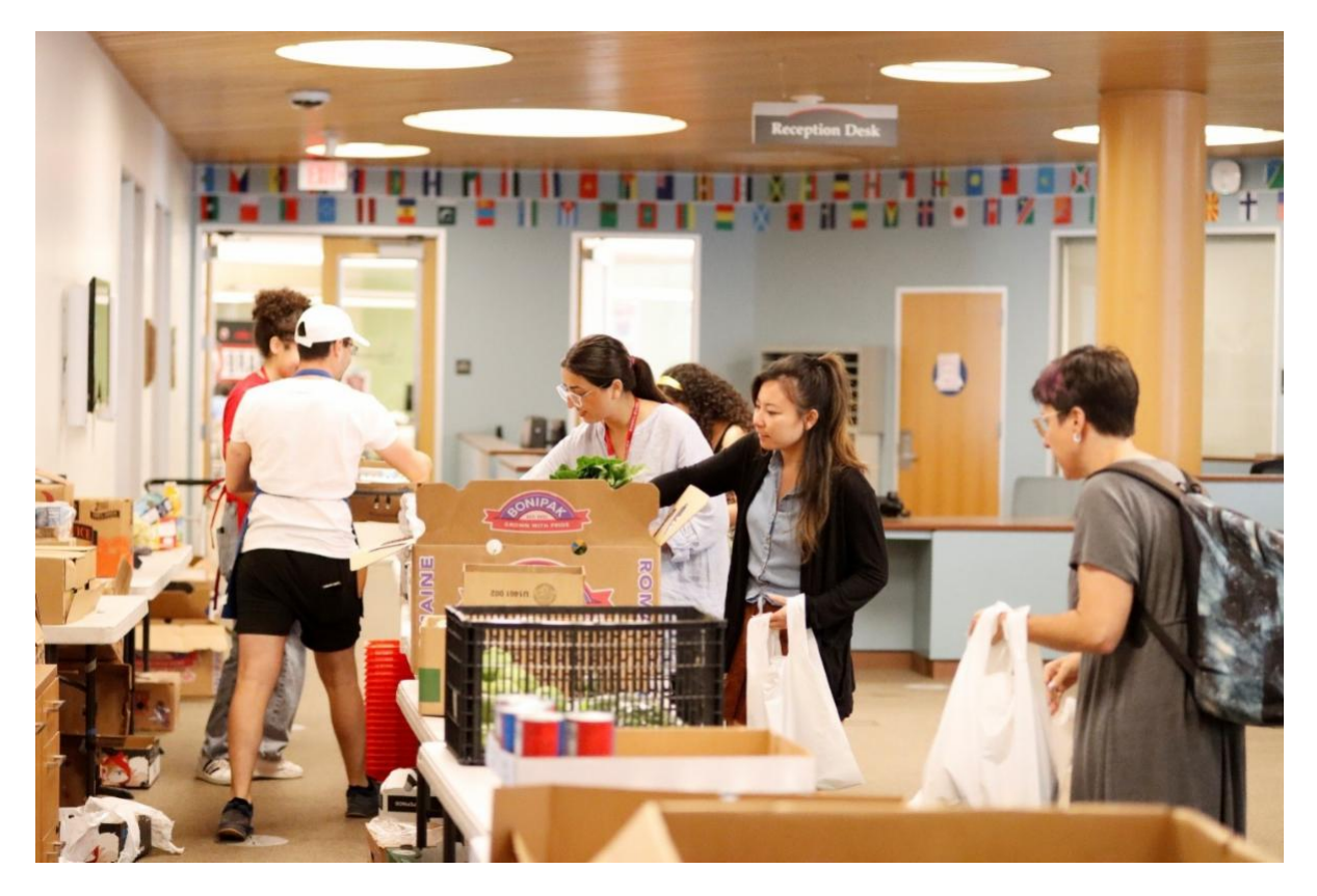
Brahma Bodega staff and volunteers package food for students