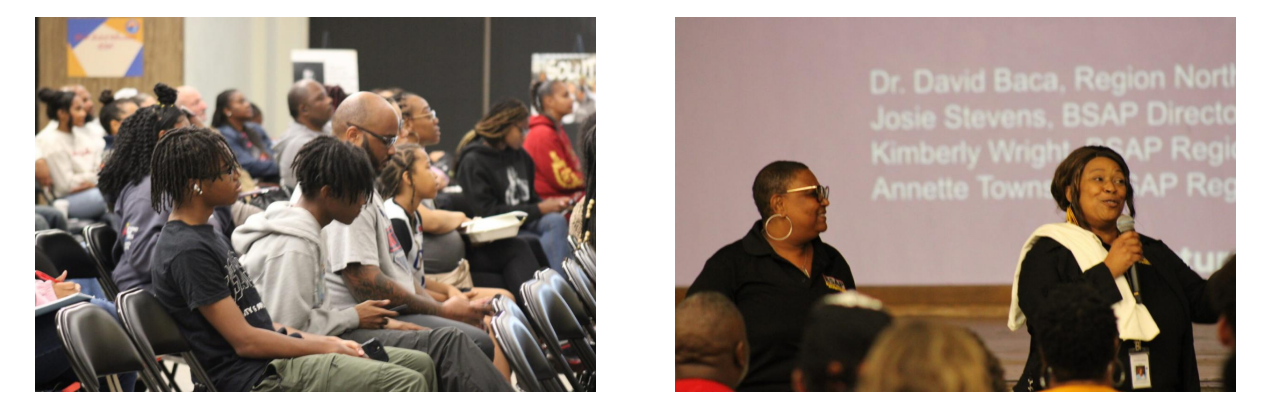
Black students and families attend a Black Excellence and Empowerment Summit workshop presented with the Village Nation and LAUSD's Black Student Achievement Plan.

LAUSD Region North students met with LA Valley, LA Mission and LA Pierce, UC, CSU and private college and university representatives at CollegeFest.