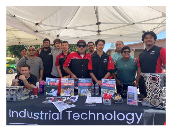
Industrial Technology Club