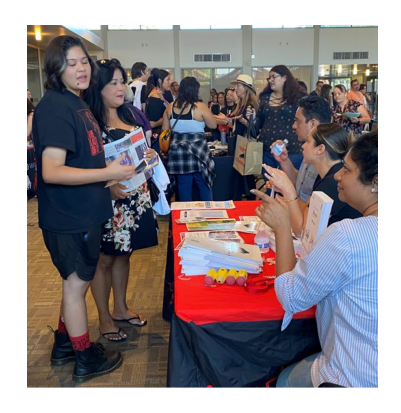
Family inquiring about classes through Adult Education.