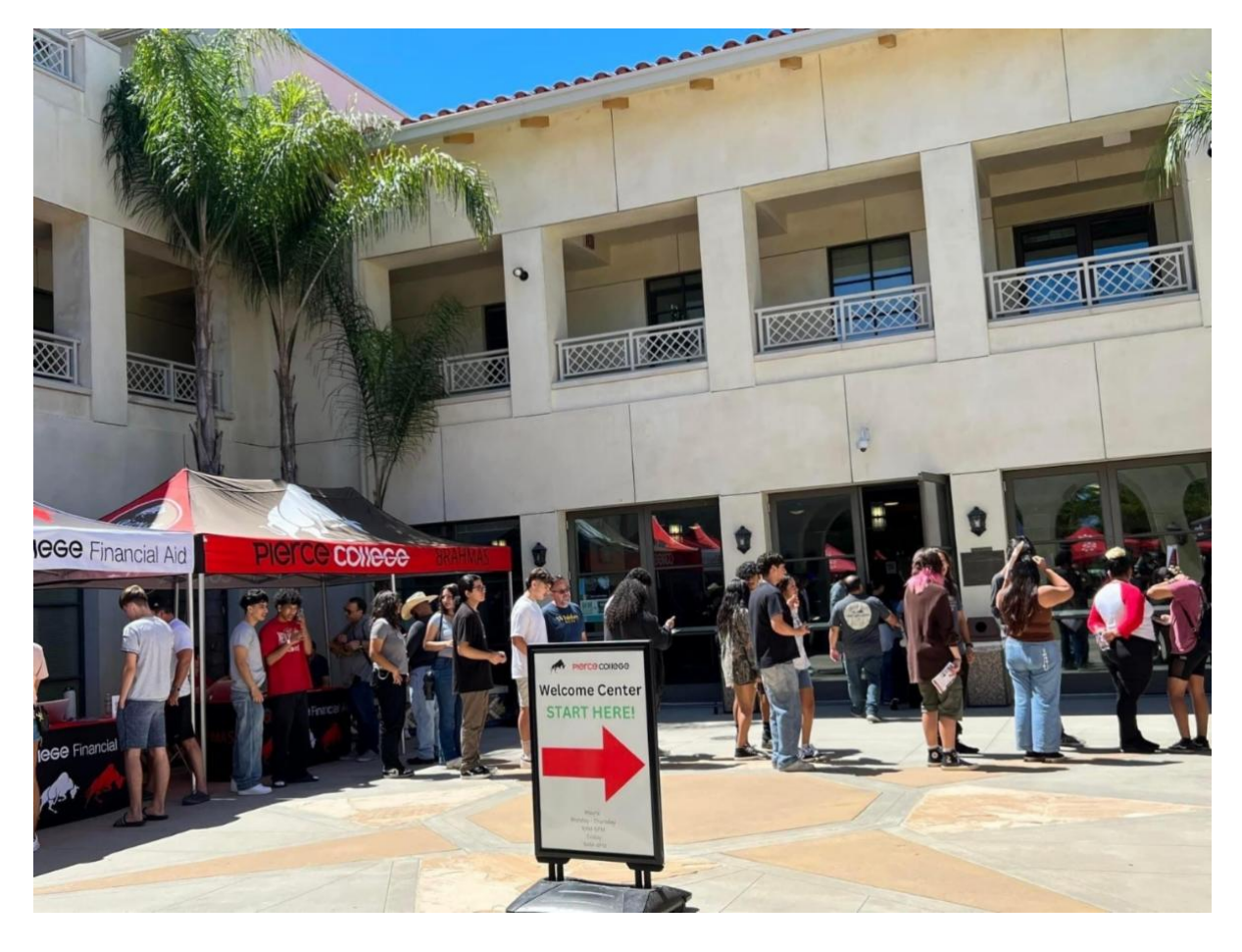
Students in line for Financial Aid and Promise Program