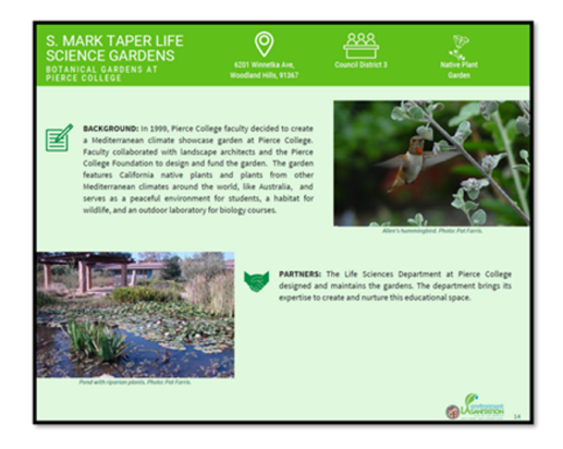
LAPC Botanical Garden in the Guidebook

It was a busy summer for LAPC as Promise Scholars were onboarded through a variety of transition programs including Summer Bridge and #Pierce Success. The summer culminated with our very first Brahma Family Night. This event provided parents with strategies and resources to help their scholars succeed at Pierce College. Workshops on retaining Promise Scholarship were also held in English and Spanish.