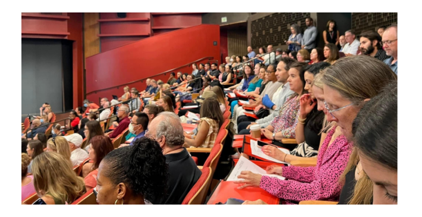
Packed house at the LAPC Performing Arts Theatre