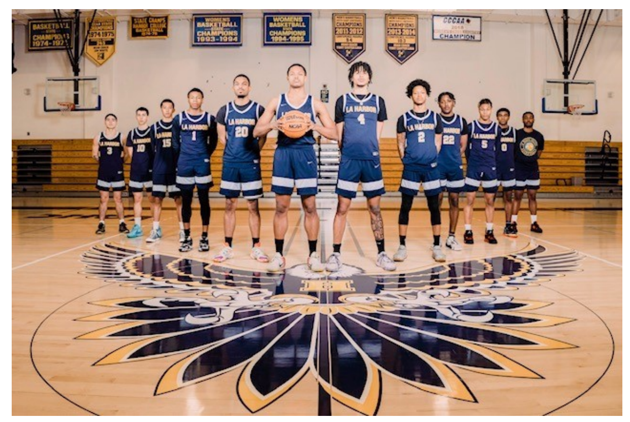
Men's Basketball has won the Conference Title for the CCCAA South Coast