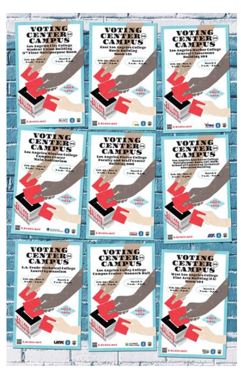
(Directional posters, above right, were displayed at all colleges for Voting Centers. Left, inside the new