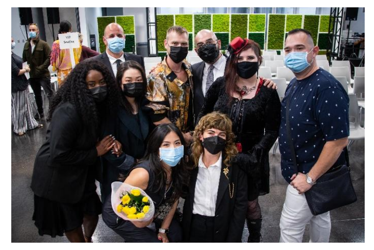
Congrats to our LATTC students fashion designers, left, for their creative couture – can't wait till the next edition of the LATTC Gold Thimble!

Students took inspiration from Broadway hit shows for their creations!