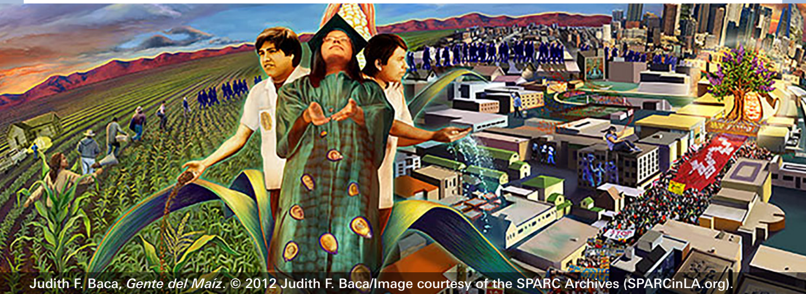
Judith F. Baca, Gente del Maíz . © 2012 Judith F. Baca/Image courtesy of the SPARC Archives (SPARCinLA.org).