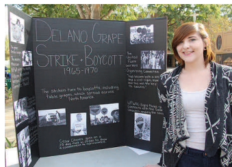
History of Working People in the US Student Poster Display by Glen Britton @LACC